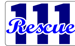
Style MP 1009