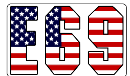
Style MP 1020