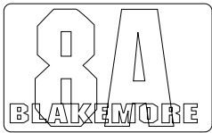
Style MP 1006