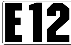
Style MP 1003