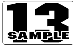
Style MP 1002