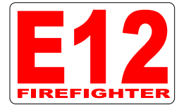
Style MP 1005