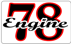
Style MP 1001