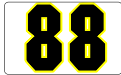
Style MP 1007