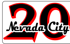
Style MP 1008