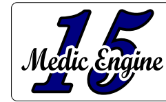
Style MP 1004