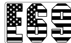
Style MP 1019