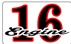
Style MP 1017