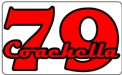
Style MP 1011