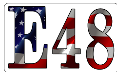
Style MP 1022