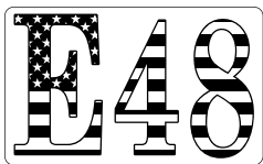
Style MP 1021